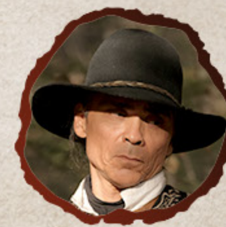
ZAHN MCCLARNON as YVON A Harvard-educated Anishinaabe (Ojibwe) man of the Hudson's Bay Company.