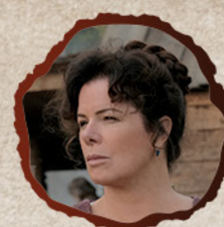
MARCIA GAY HARDEN as MATHILDE GEFFARD An innkeeper and burgeoning power player in the town who knows everyone's secrets.