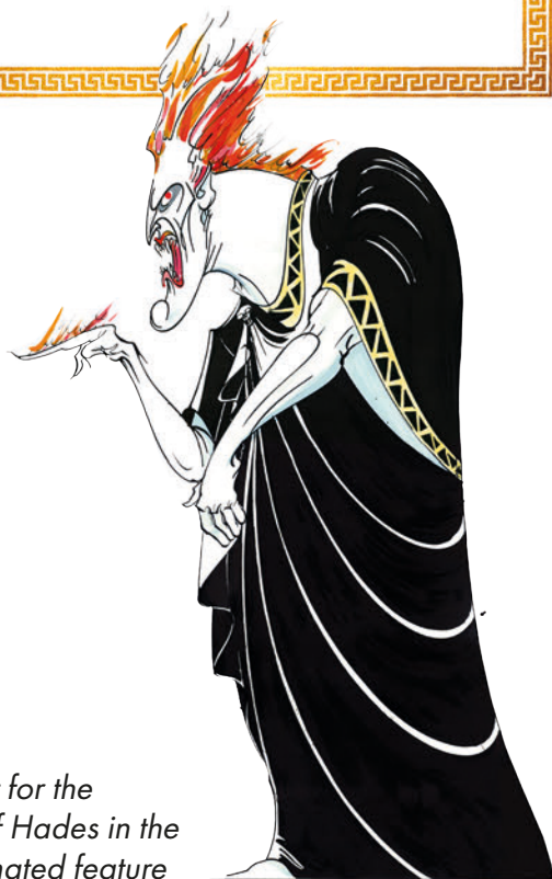
Concept art for the character of Hades in the Disney animated feature